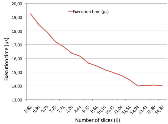
Figure 2: Different implementations for model F

to 14 \mu s respectively with an area utilization varying from 5,800 to 14,300 slices. Indeed, more we parallelize the model F main loop, the occupied hardware increases and the execution time is reduced. The software implementation on the host offers an execu-